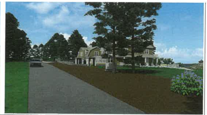
WALNUT ST. - GENERATOR NO PLANTING SCALE: N/A