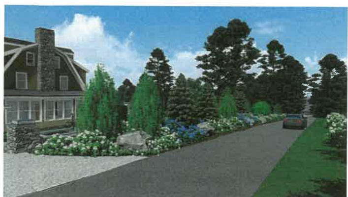
WALNUT ST. - GENERATOR SCREEN PLANTING SCALE: N/A