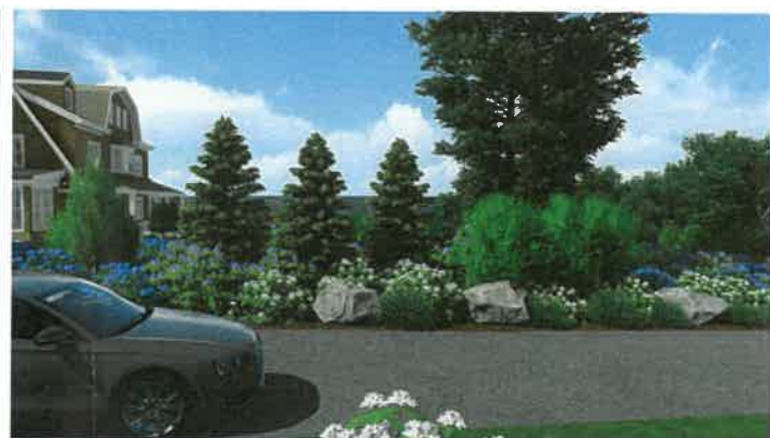
WALNUT ST. - GENERATOR SCREEN PLANTING SCALE: N/A