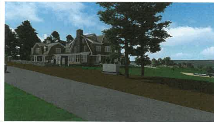
WALNUT ST. - GENERATOR NO PLANTING SCALE: N/A