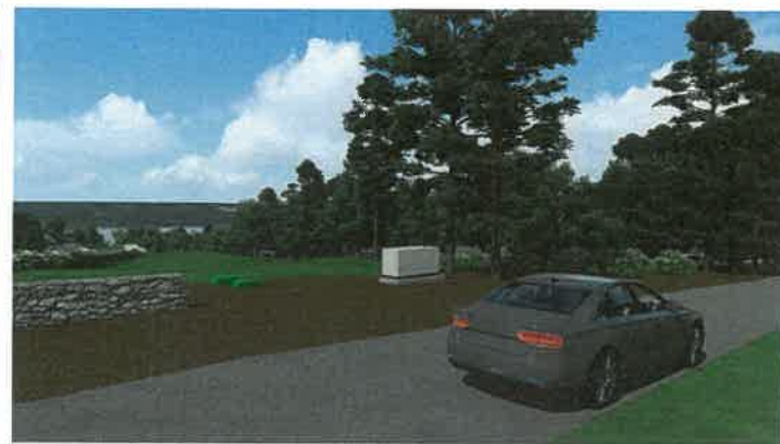
WALNUT ST. - GENERATOR NO PLANTING SCALE: N/A