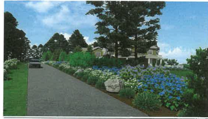
WALNUT ST. - GENERATOR SCREEN PLANTING SCALE: N/A

NEW GENERATOR & PROPANE CAPS TO HAVE SCREEN PLANTING