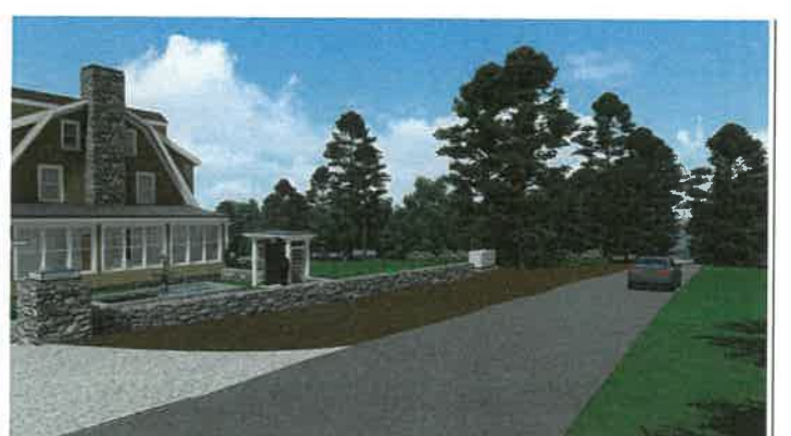
WALNUT ST. - GENERATOR NO PLANTING SCALE: N/A