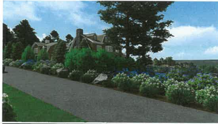
WALNUT ST. - GENERATOR SCREEN PLANTING SCALE: N/A