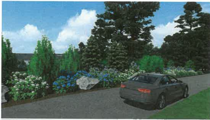
WALNUT ST. - GENERATOR SCREEN PLANTING SCALE: N/A