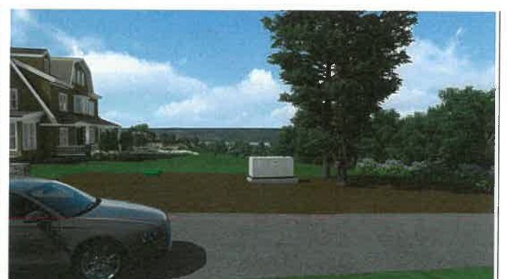
WALNUT ST. - GENERATOR NO PLANTING SCALE: N/A