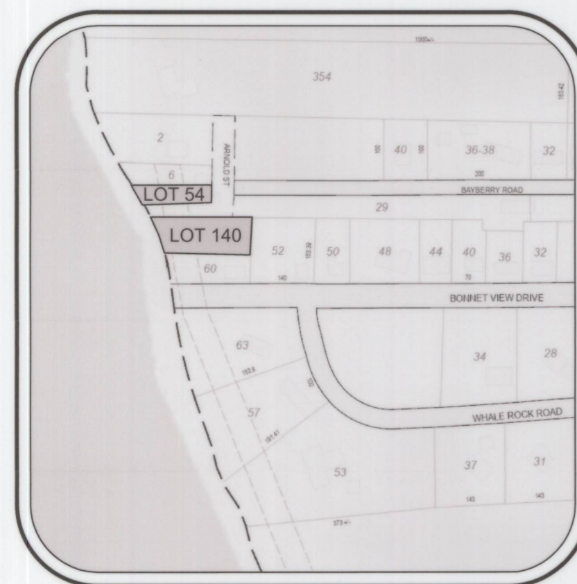
LOCUS MAP NOT TO SCALE

BEING A.P. 12, LOTS 57 & 140 AREA OF LOT 57 = 5,891.9 S.F. AREA OF LOT 140 = 10,376.2 S.F.