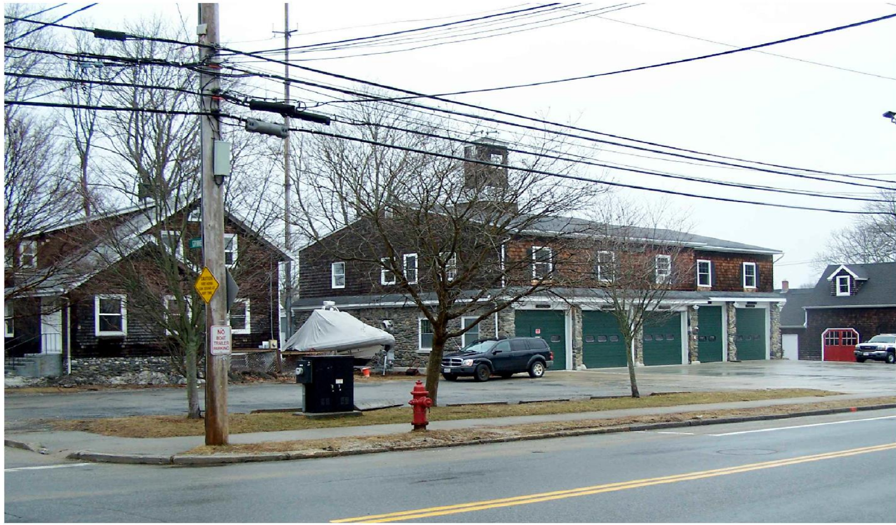
EXISTING VIEW - TRAVELING EAST ON NARRAGANSETT AVE SCALE: NTS