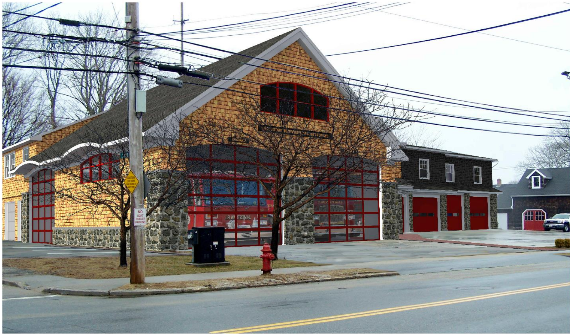
PROPOSED VIEW - TRAVELING EAST ON NARRAGANSETT AVE SCALE: NTS