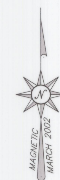
LOCUS - NO SCALE