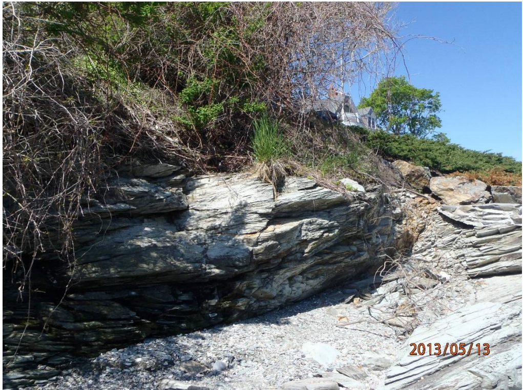
Westerly View from Shoreline