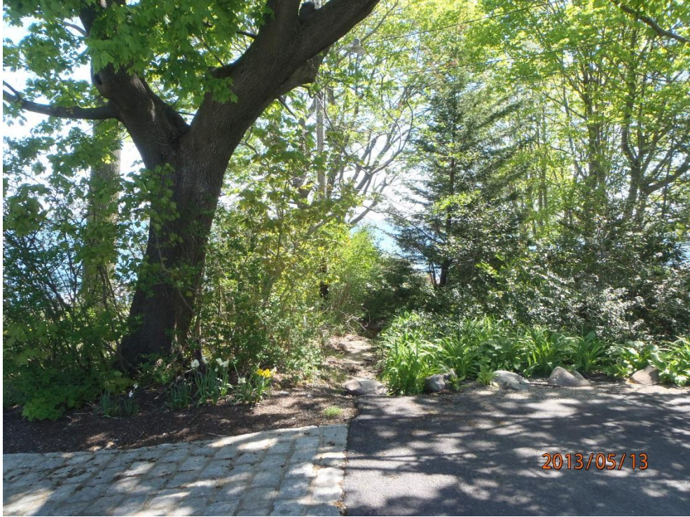
View from High St.