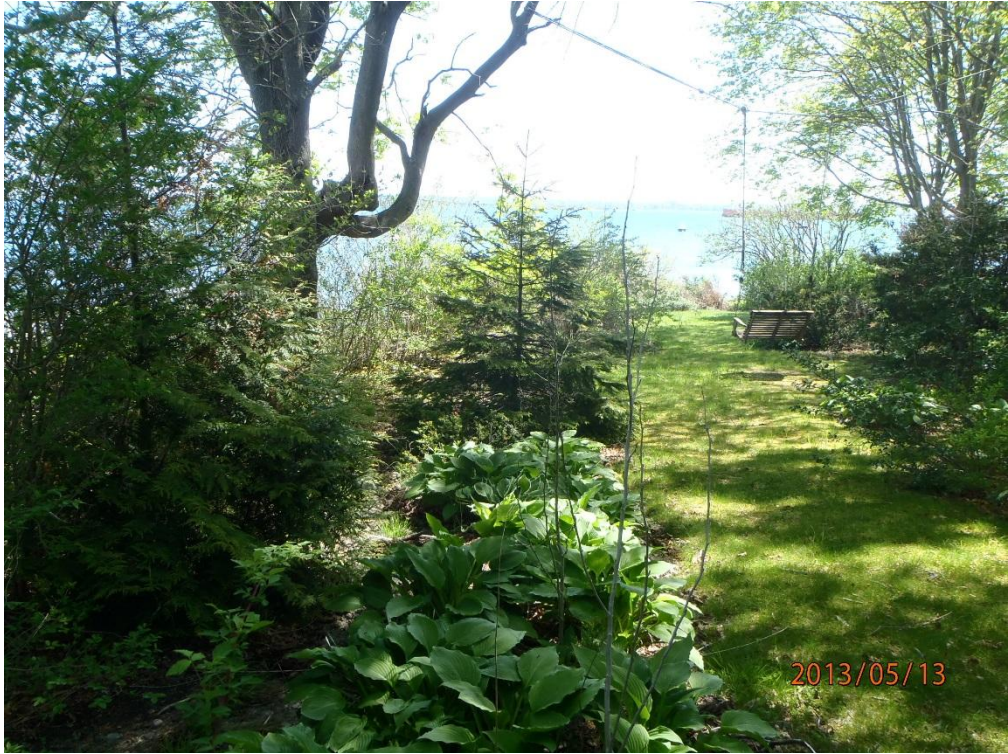
Overgrown Path on left, possible encroachment on right.