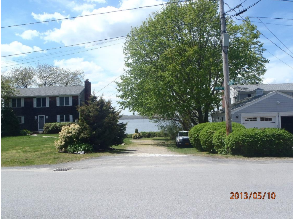
View from Seaside Drive