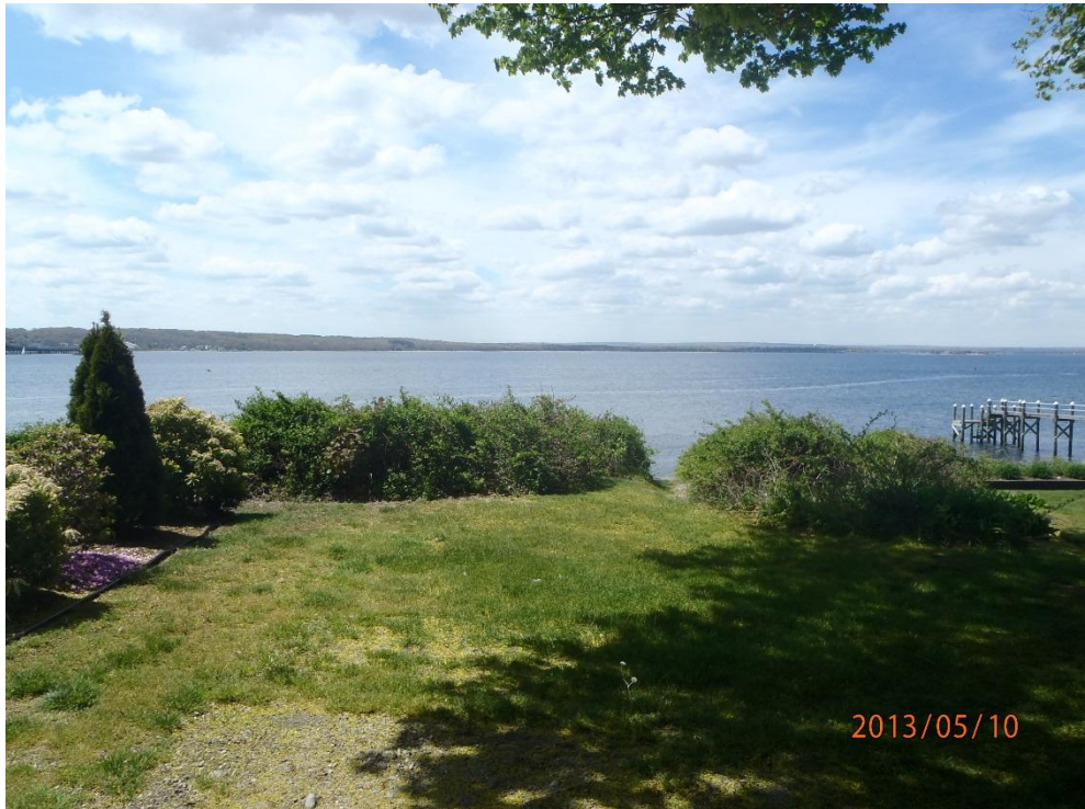
Grassy Area maintained by Abutters