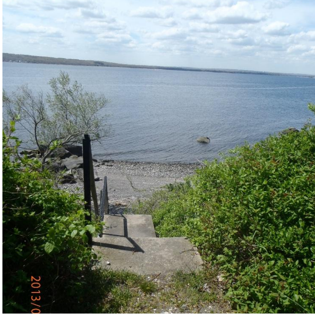
View of Existing Narrow Staircase