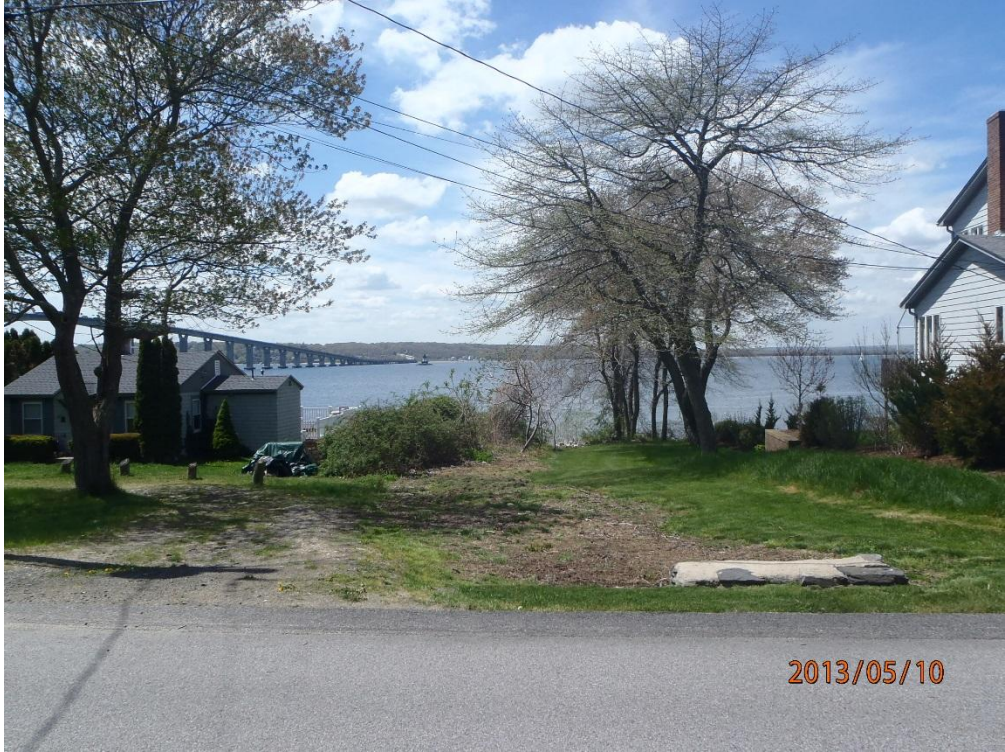
View from Seaside Drive. Cleared in 2011