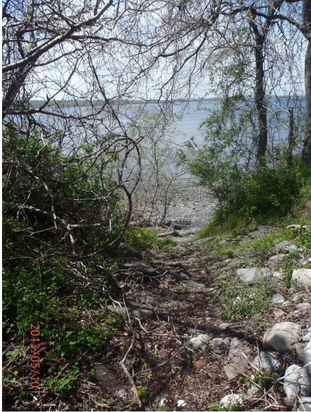
View looking West