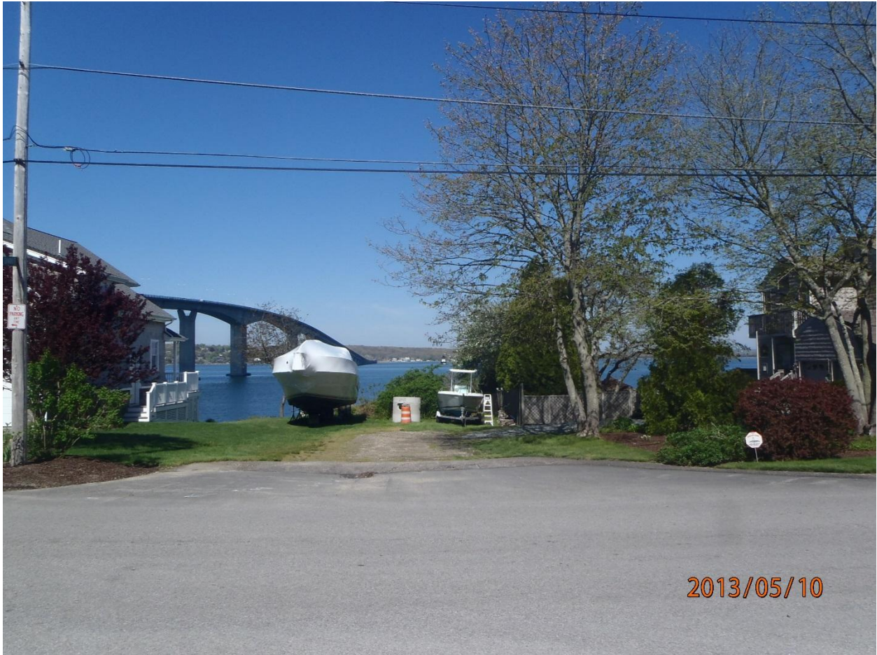
View from Seaside Drive. Abutters currently storing boats (above) and firewood (bottom left) Overgrown with Shrubs and no access to shore (bottom right)