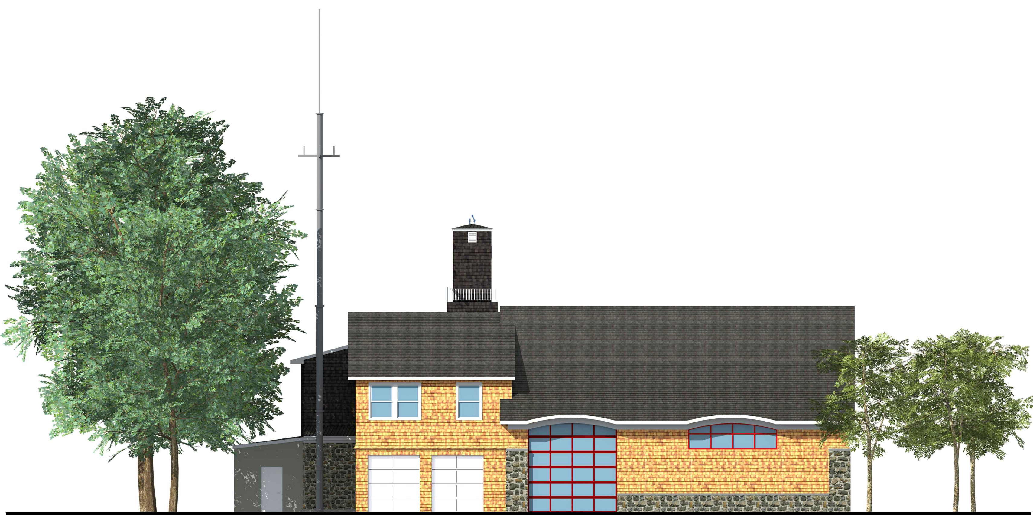
SCHEMATIC SIDE ELEVATION - GRINNELL STREET