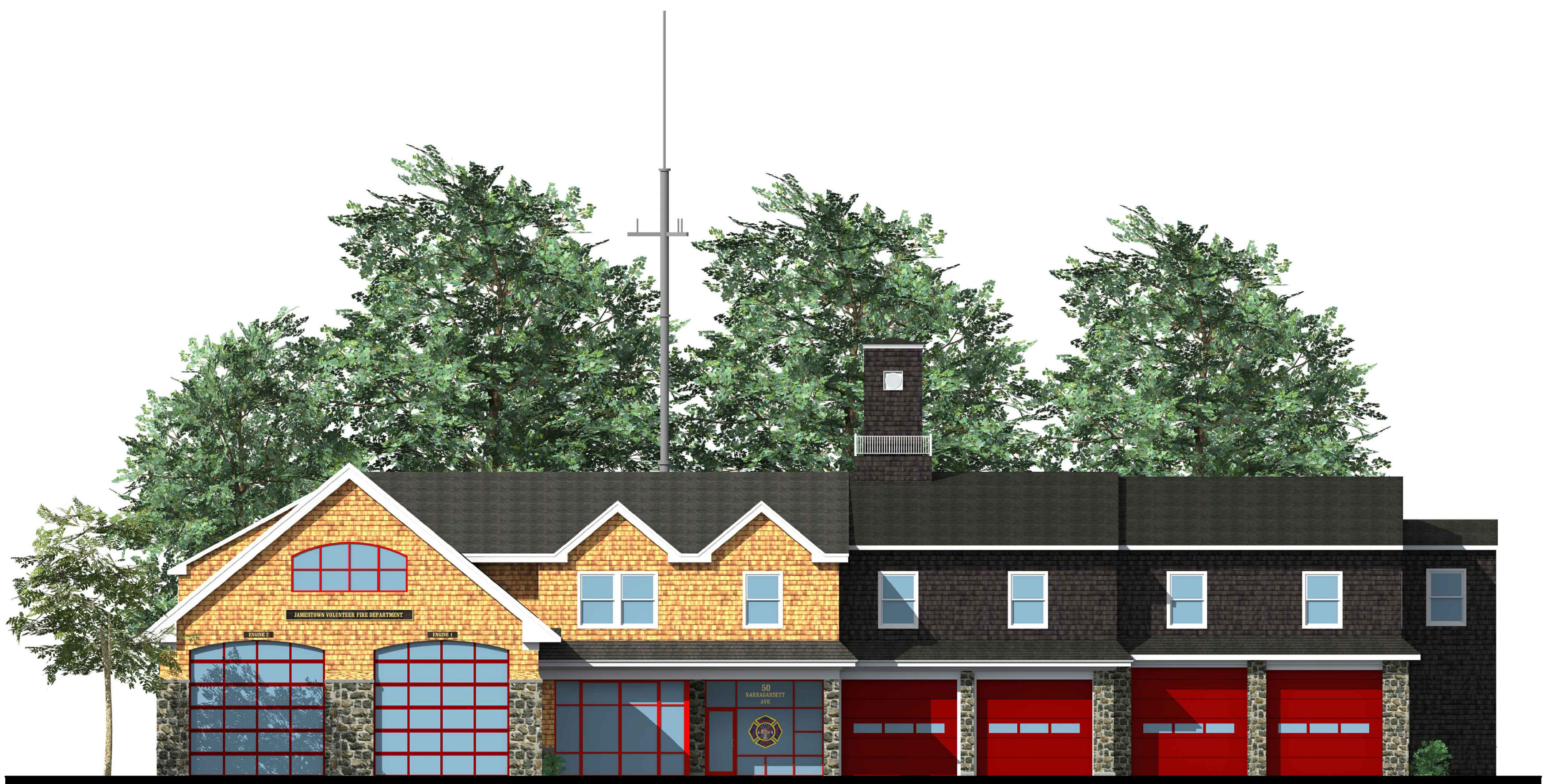
SCHEMATIC FRONT ELEVATION - NARRAGANSETT AVENUE