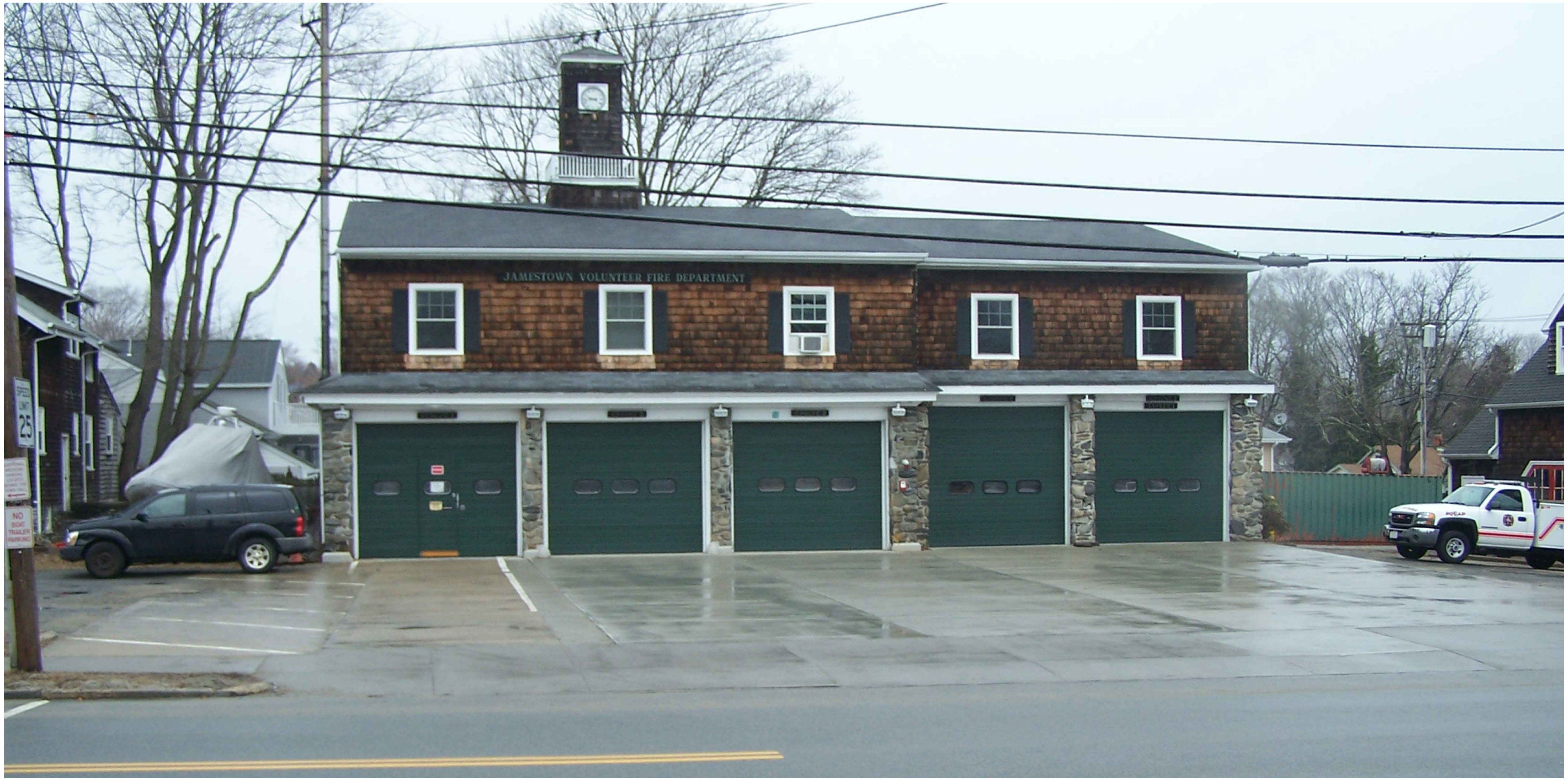
EXISTING FRONT ELEVATION - NARRAGANSETT AVENUE