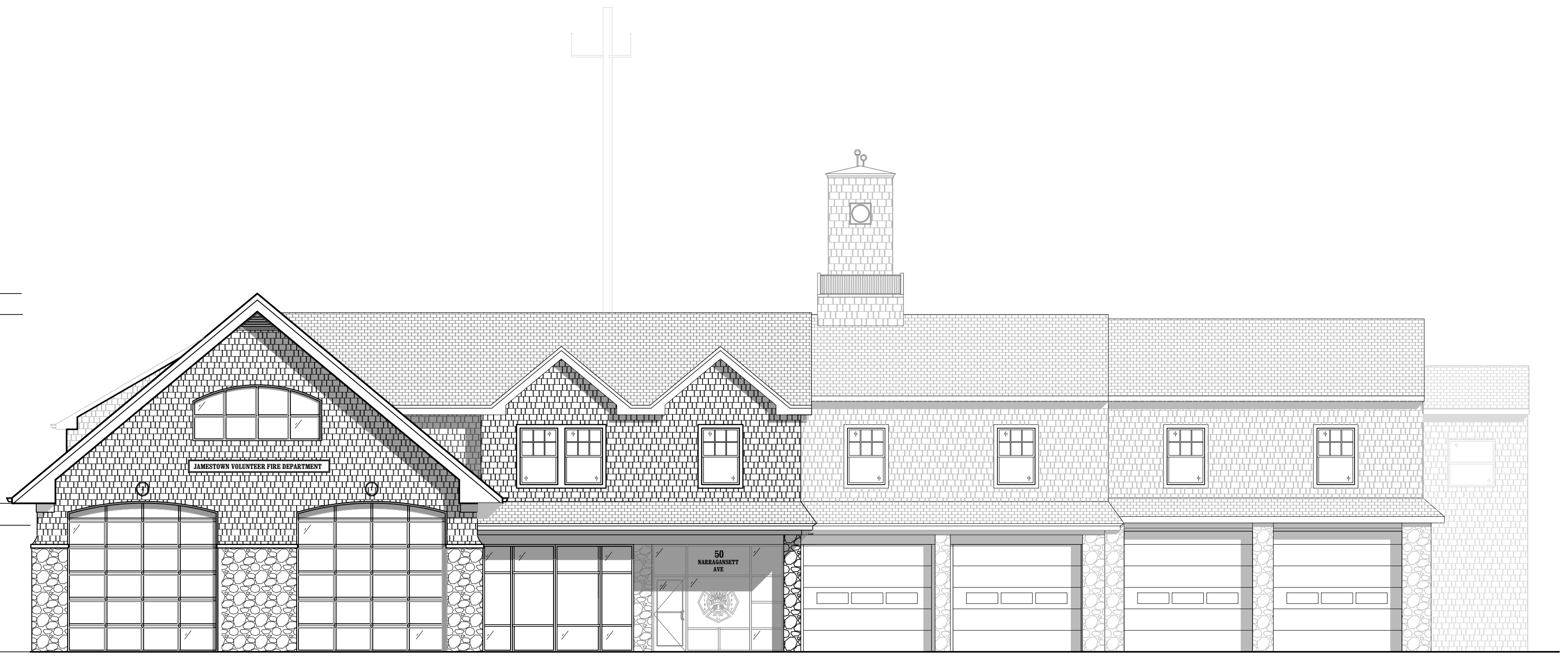
1 SCHEMATIC FRONT ELEVATION - NARRAGANSETT AVENUE SCALE: 1/8"=1'-0"

APPARATUS BAY ROOF 33'-2 3/4" ADDITION ROOF 33'-4 5/8"