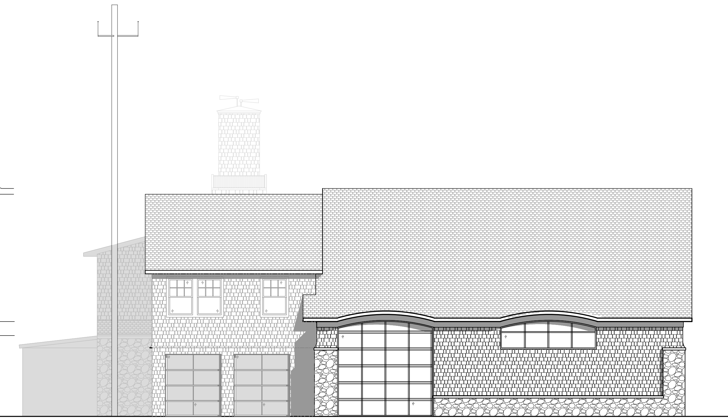
2 SCHEMATIC SIDE ELEVATION - GRINNELL STREET SCALE: 1/8"=1'-0"