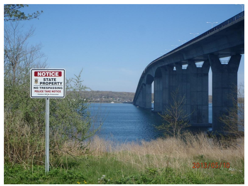
View from Seaside Drive. Posted No Trespassing Signs by RIDOT

Open grassy area where the old Jamestown Bridge used to be (above) with some brush and existing footpath sloping to shoreline (left)