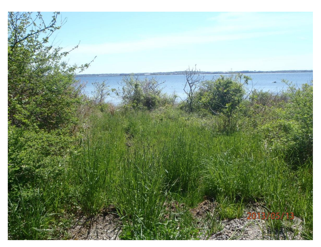
ROW at end of Decatur Ave