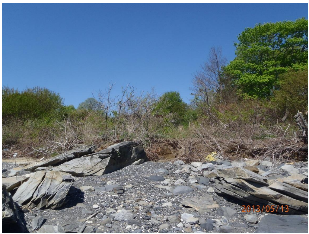
Westerly View from Shoreline