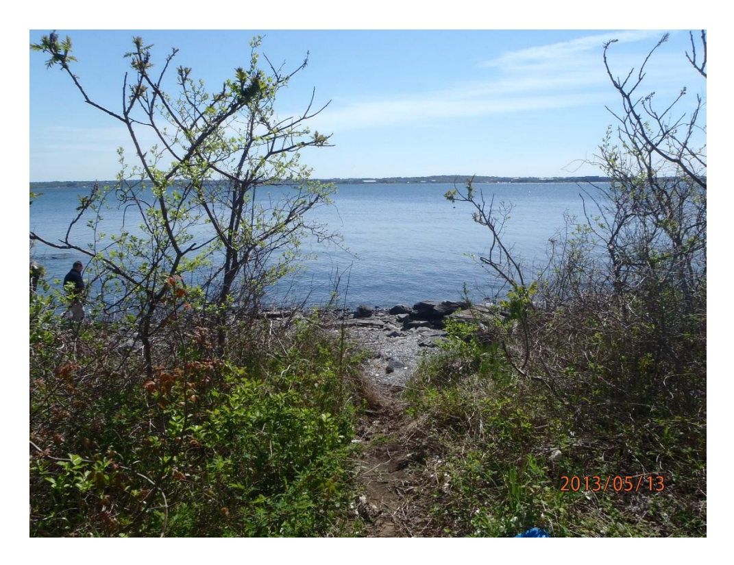
Gentle Sloping pathway to rocky shoreline