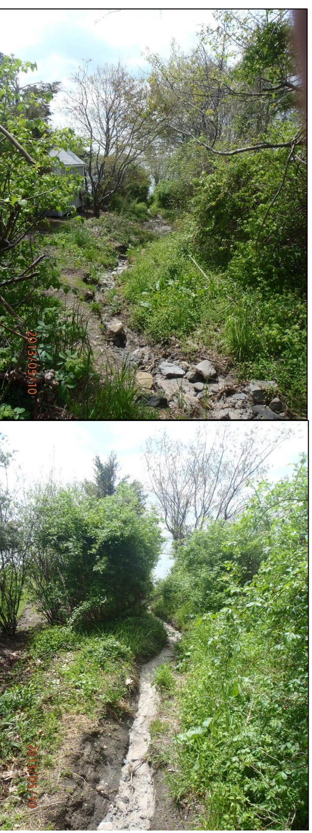
Existing footpath prone to erosion due to runoff from Capstan St