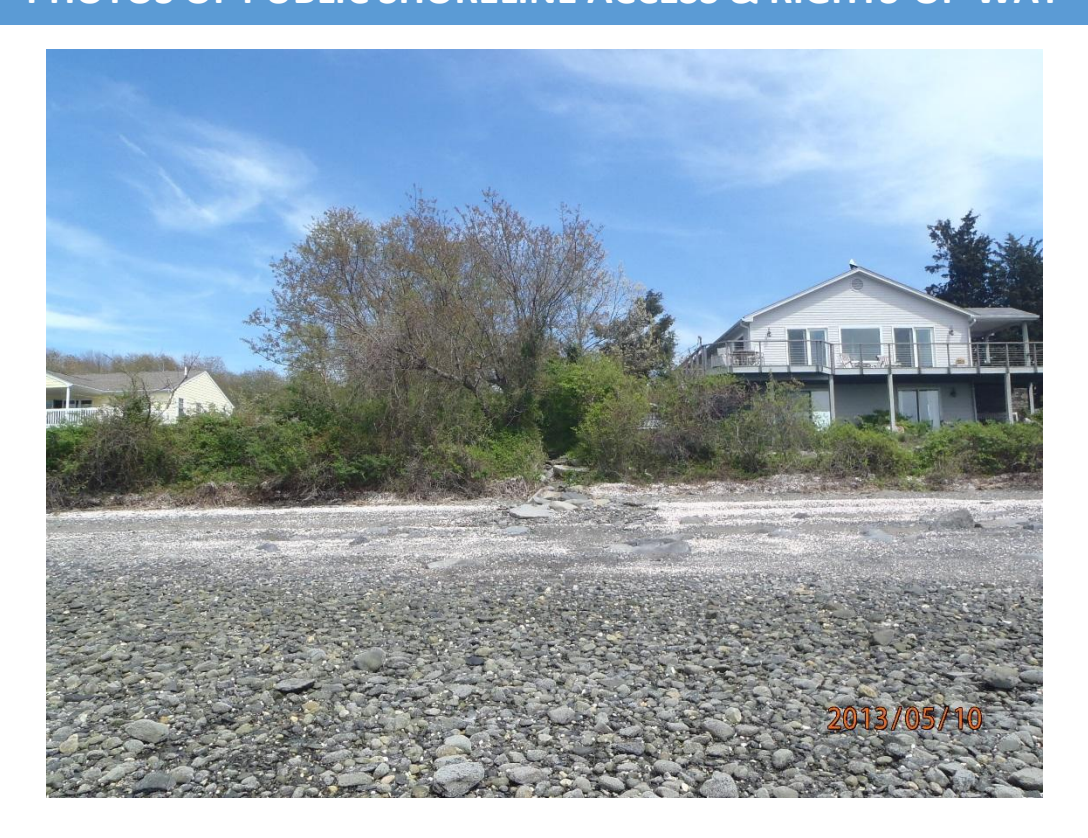
Easterly View from Shoreline