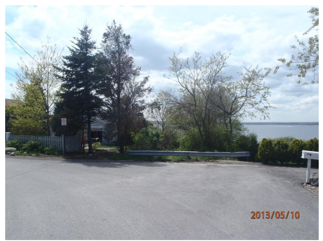
View from Capstan St.