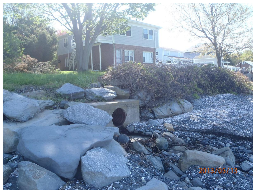
Grassy Path ends at Stormwater Outfall