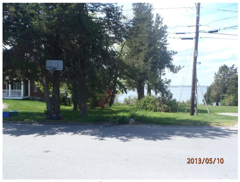
View from Seaside Drive