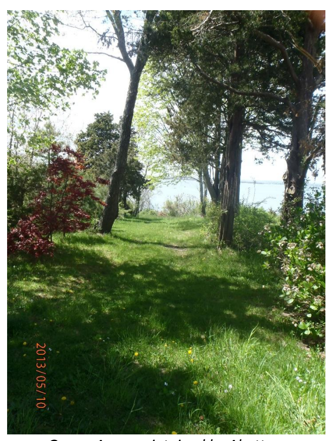
Grassy Area maintained by Abutters