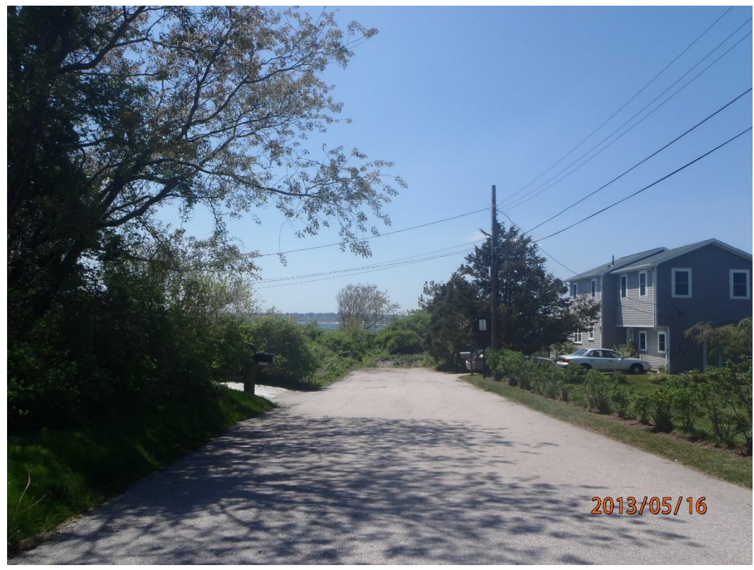
View from Bonnet View Drive