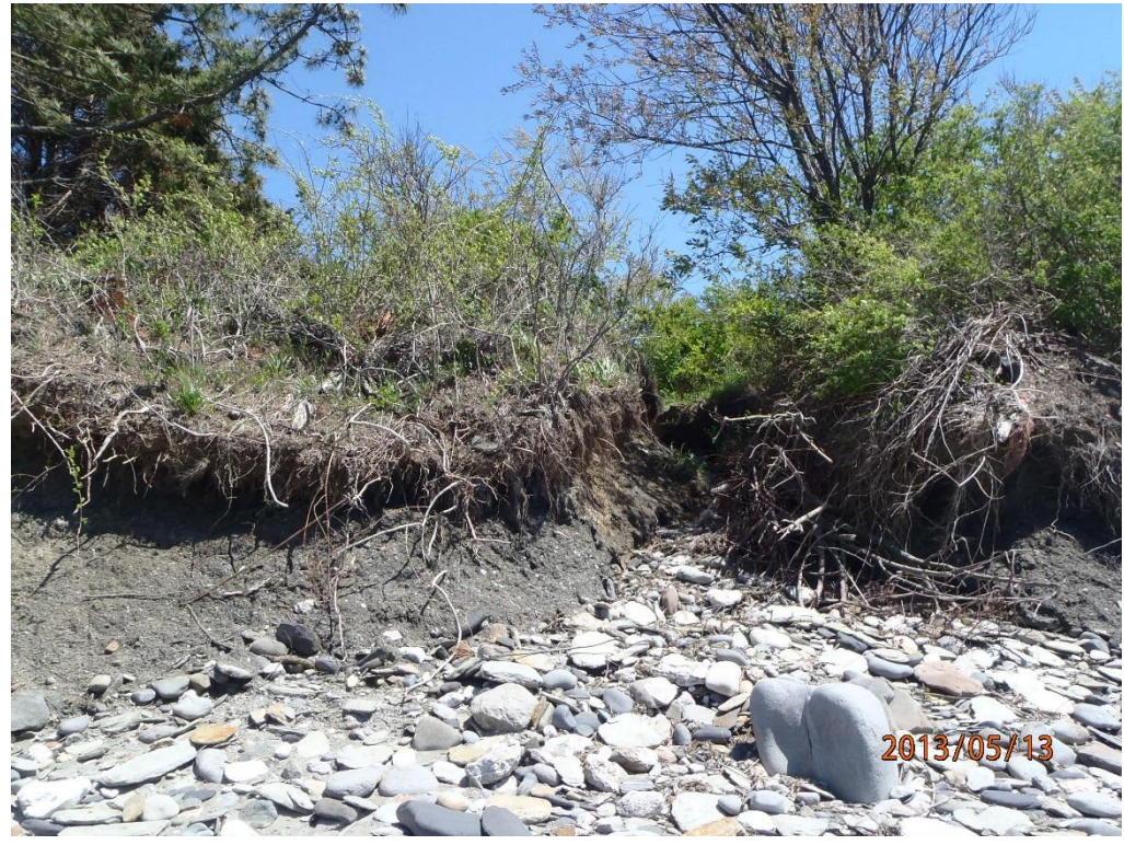
Easterly View from Shoreline