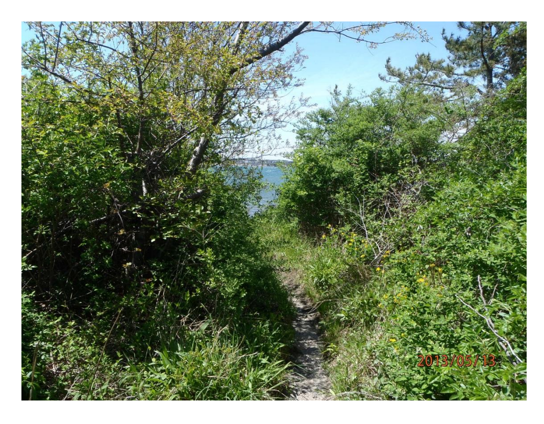
Existing foot path with steep slope to shore