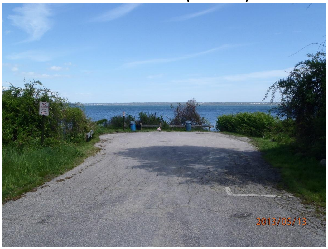
Existing Parking Area, Signage, and Trail Markers