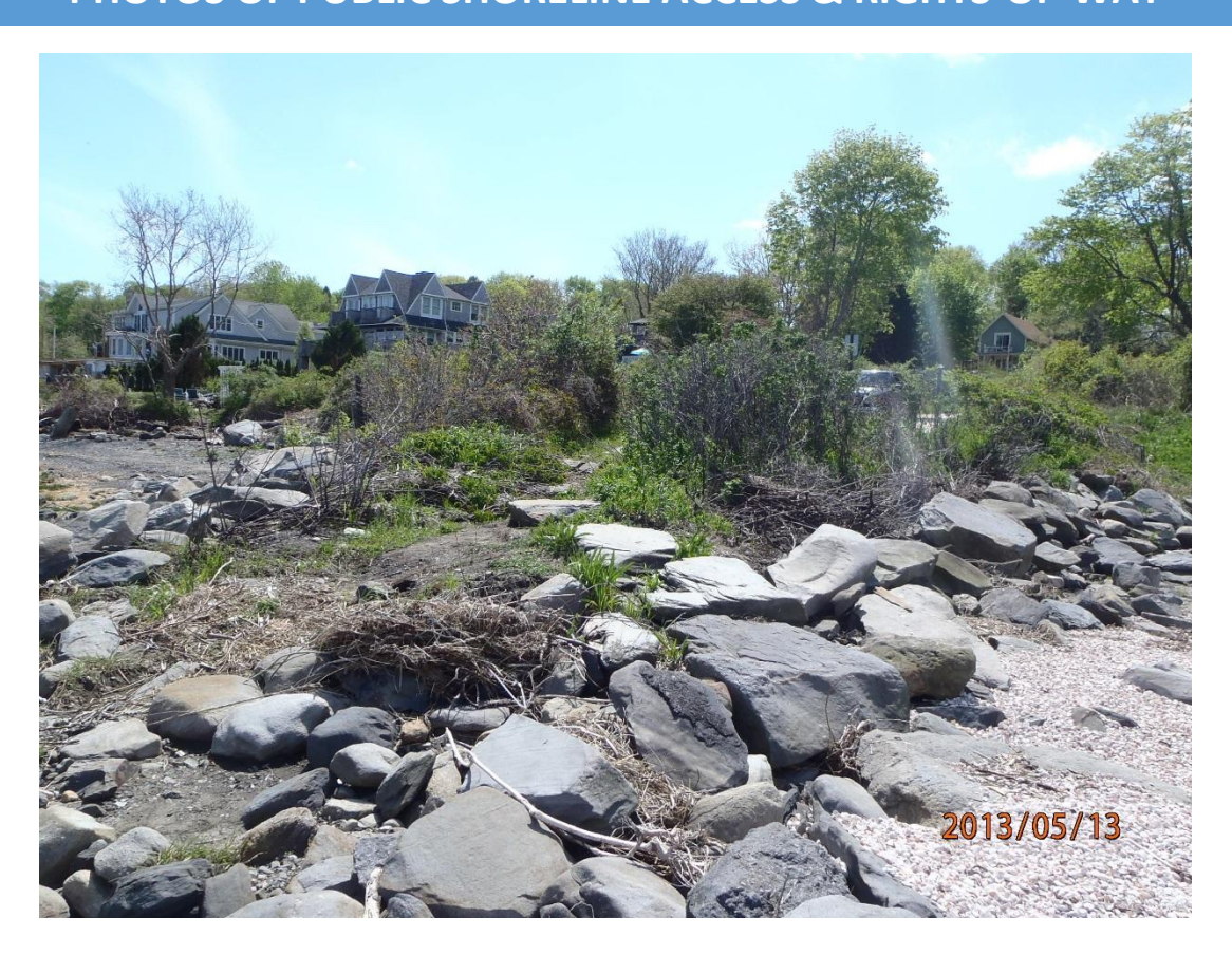
View of Rock Jetty and Sandy Beach