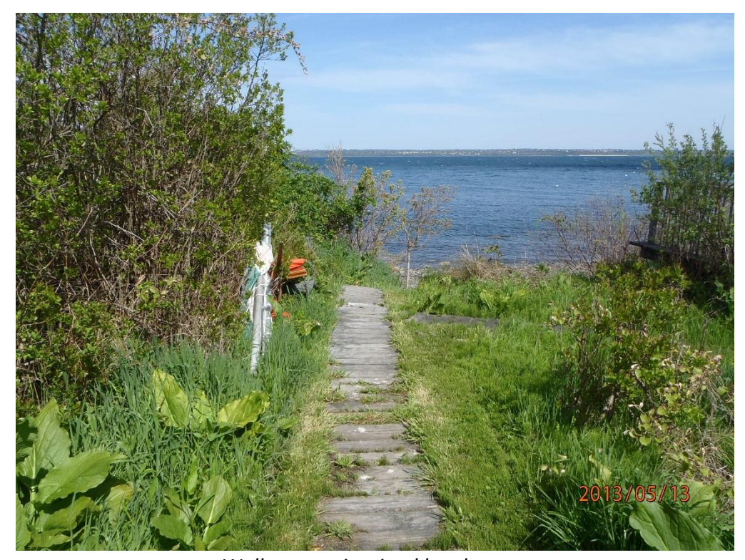
Walkway maintained by abutters