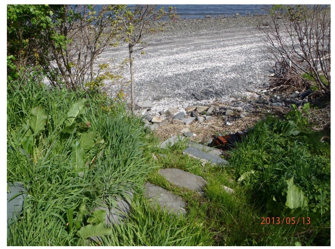
Path Abruptly ends at shore