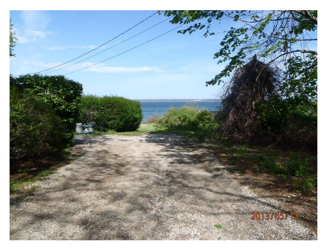
Existing footpath at end of dirt road