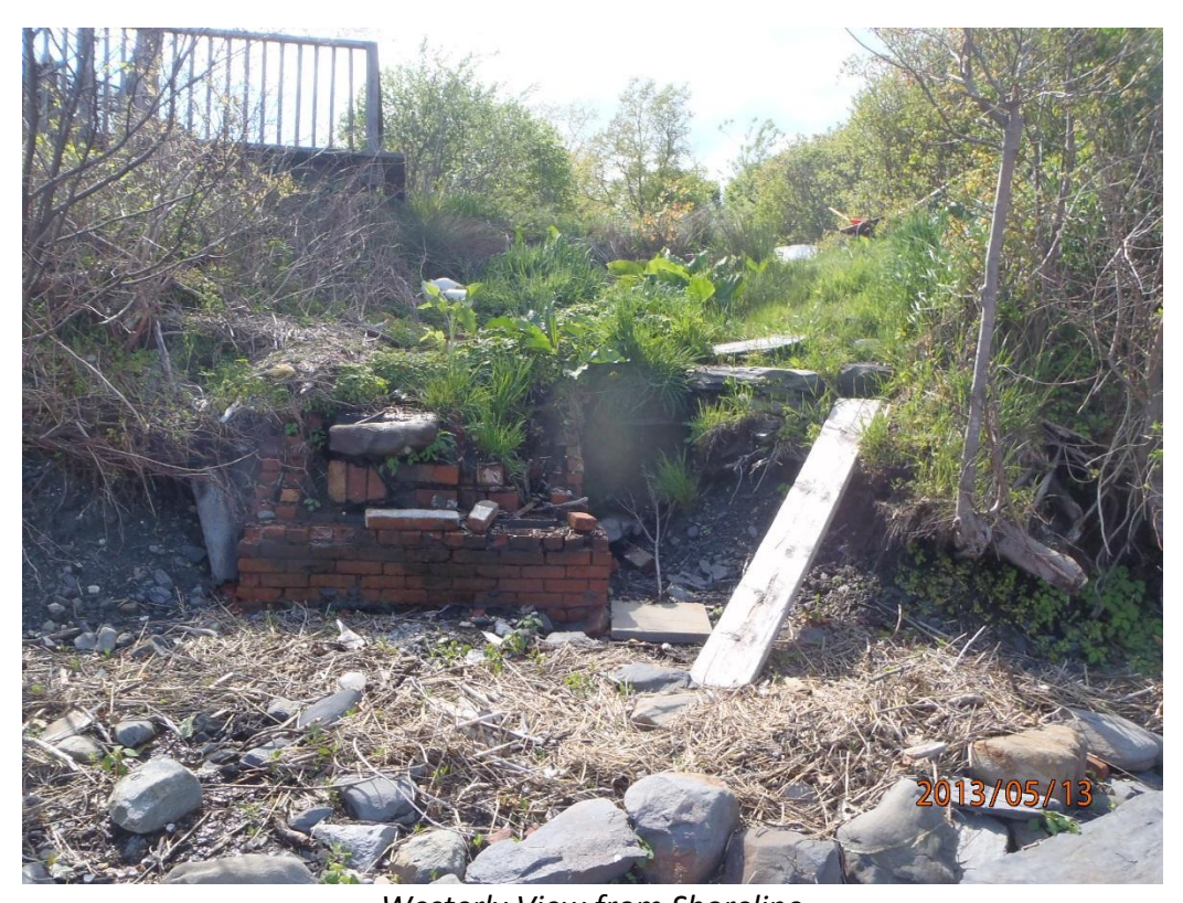
Westerly View from Shoreline