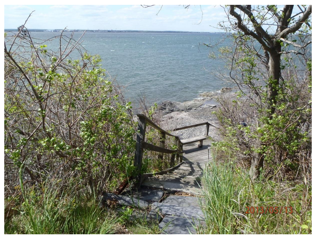
Stairs and Decking to the shoreline