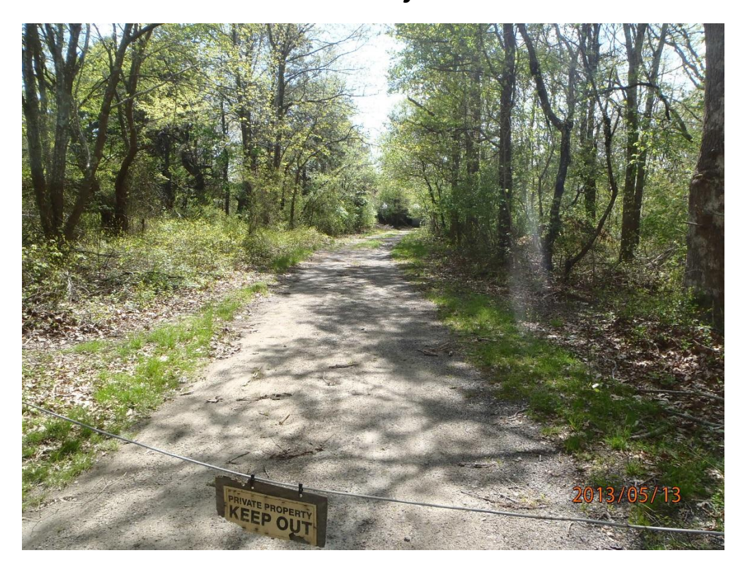
Dirt road gated, chained, and marked "PRIVATE PROPERTY"