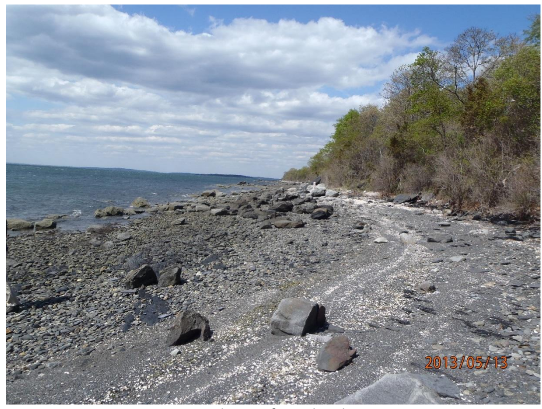
Easterly View from Shoreline